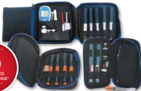
MEDACTIV iCool Prestige $69.95 , Easy Bag Classic $48.95 or iCool Weekender $49.95