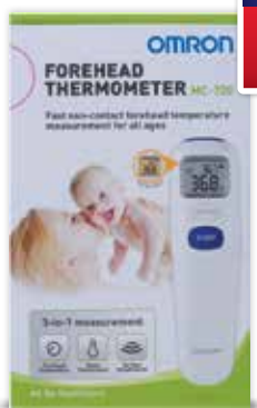
OMRON Forehead Thermometer MC-720